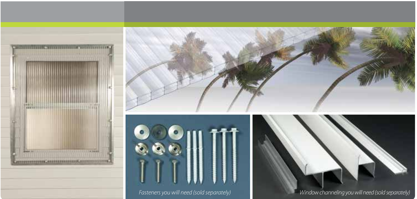
Fasteners you will need (sold separately)